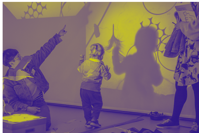
SPIKE ISLAND OPEN STUDIOS 2023. PHOTOGRAPHY BY DAN WEILL

At Open Studios, visitors are invited to immerse themselves in a community of over 70 studio artists, get inspired in creative workshops, meet local creative businesses, get exclusive insights into how contemporary art is produced, and enjoy food and drinks from beloved Bristolian traders.